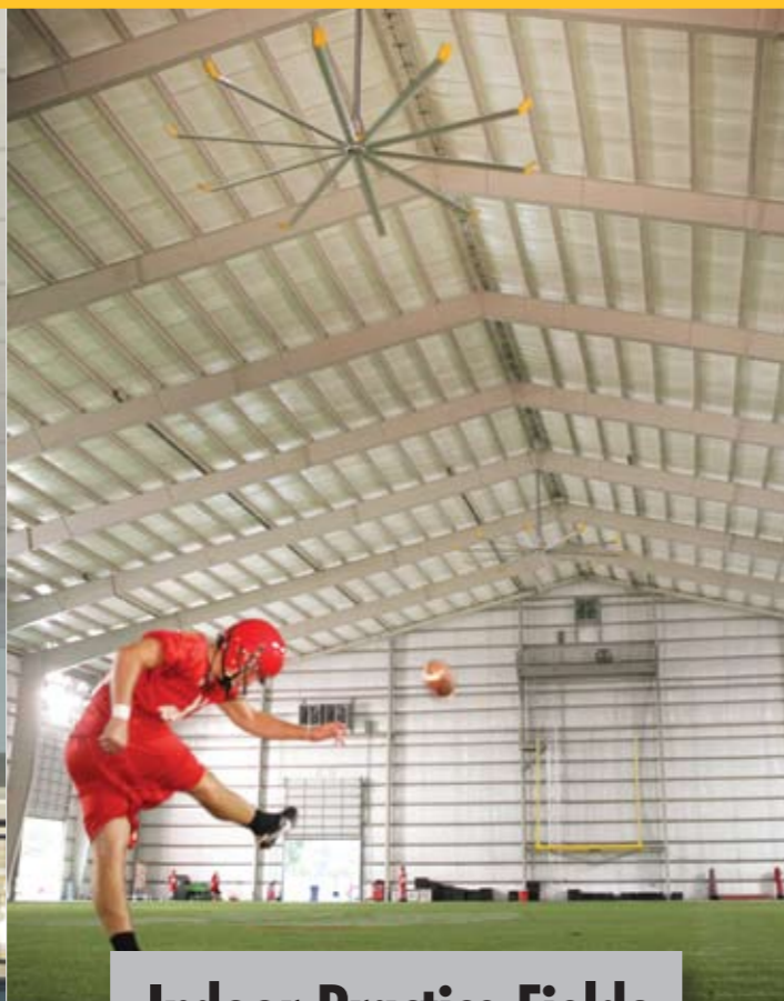
Indoor Practice Fields