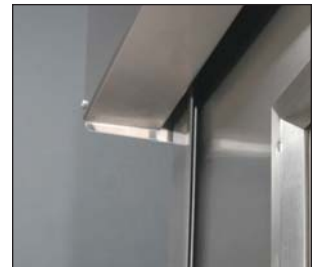
COMPLETE STAINLESS PACKAGE Provides the ultimate in sealing and cleanability.