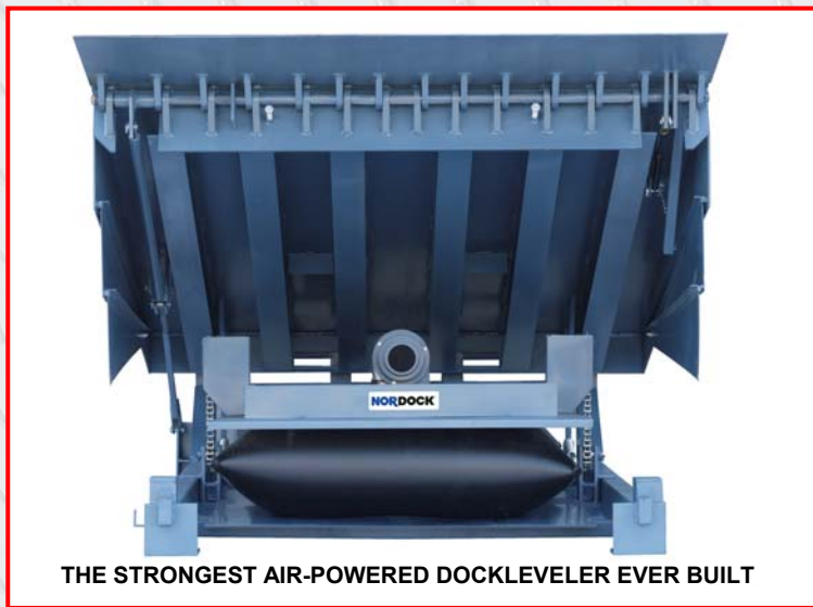
THE STRONGEST AIR-POWERED DOCKLEVELER EVER BUILT