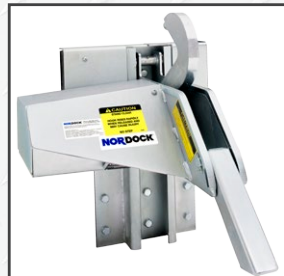
SMART-HOOK® & TRUCK-LOCK® VEHICLE RESTRAINTS