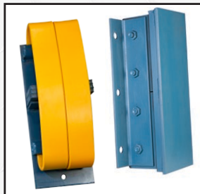
IMPACT™ SERIES DOCK BUMPERS