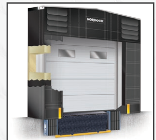
WEARTOUGH® DOCK SEALS & SHELTERS