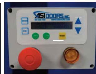
REMOTE DIGITAL DISPLAY