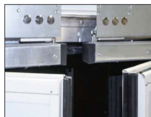
OPTIONAL BREAKAWAY PANELS