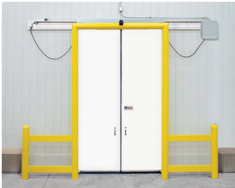
Shown with power operator.

Innovative Design. Superior Quality. Exceptional Value.