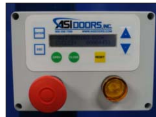
REMOTE DIGITAL DISPLAY