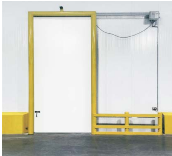
Shown with power operator.

Designed for high cycle operation, every aspect of the XP door was engineered to eliminate maintenance and downtime. The entire door system requires no lubrication and has no metal-to-metal contact eliminating wearing surfaces. The door's gasket design, no wood construction, simple quick connect heat, and one-piece gasket system, virtually eliminates maintenance.