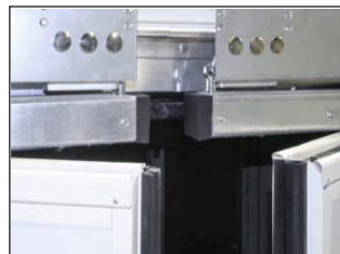
OPTIONAL BREAKAWAY PANEL