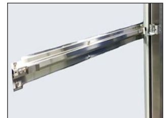
OPTIONAL BREAKAWAY WALL TRACK