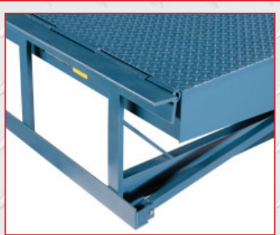
FULL WIDTH REAR HINGE WITH ZINC PLATED ROD