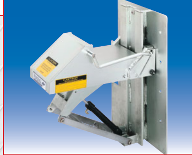
AVAILABLE TRUCK-LOCK® SAFETY SYSTEMS