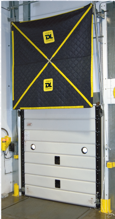
The Leveler Blanket™ conveniently stores up and out of the way.

Be sure to check out our website for other GREEN products by DL Manufacturing.