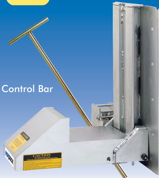
Low Profile Stored Position