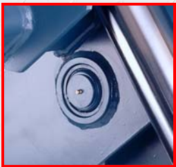
SPHERICAL CENTER BEARING