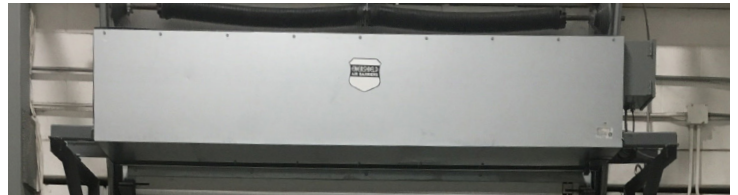
2 OF 3 AIR BARRIERS INSTALLED AT LOCATION #1