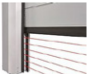
Built-in light grid up to 8 ft. high

In addition, every Speed-Guardian 5000 U42 door comes with Hormann's Smart Start NXT, NEMA-4, control box which is constructed to provide protection against dust, dirt, and water. A light grid up to eight-feet high is also included as a built-in feature of this door.