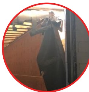
OLD LOADING DOCK SHELTERS: WORN OUT AND FALLING APART