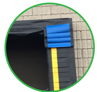
NEW LOADING DOCK SHELTERS: WEATHERTIGHT SEAL