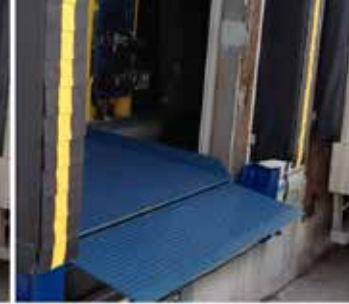
1. Lower Towards Trailer