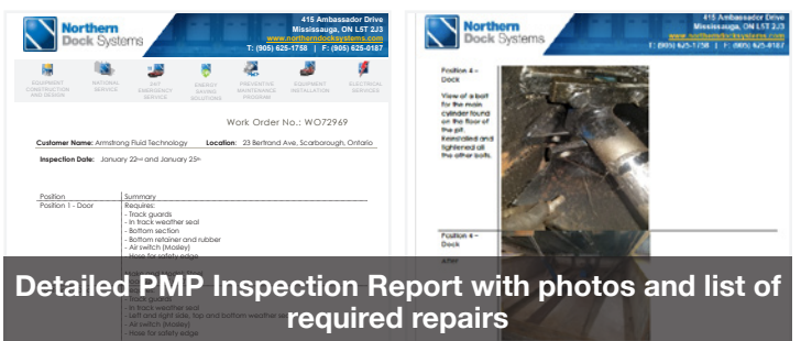
Detailed PMP Inspection Report with photos and list of required repairs